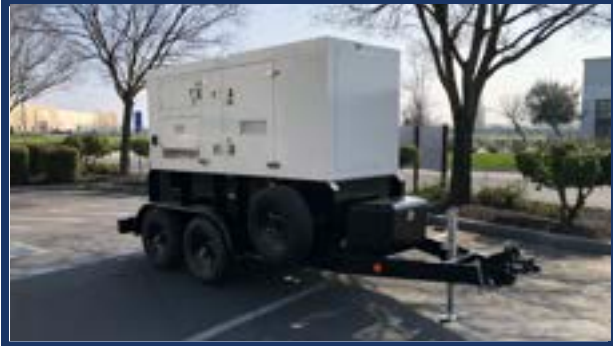
LARGE CAPACITY FUEL CELL

UQ-80: Standby Rating: 81 kVA / 65kW Prime Rating: 73kVA / 59kW