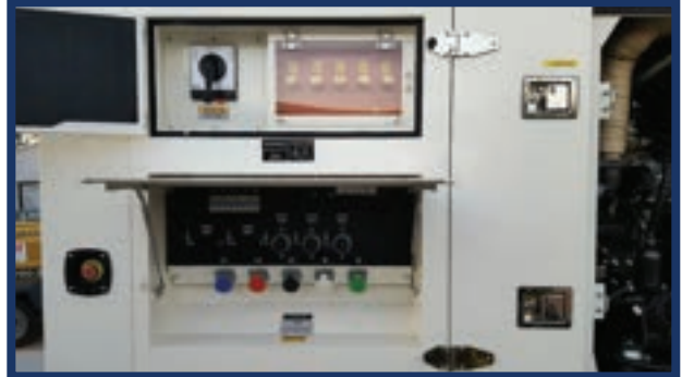
CUSTOMER CONNECTION PANEL