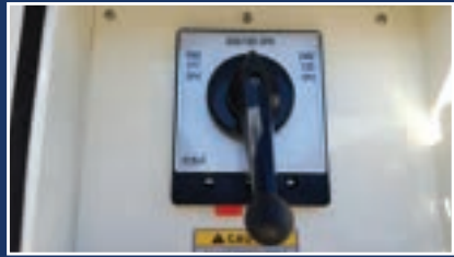
3 POSITION VOLTAGE SELECTOR SWITCH