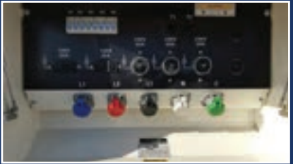
CUSTOMER CONNECTION CAM-LOK STANDARD