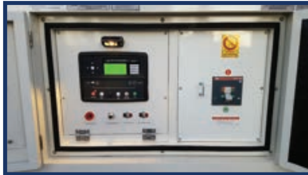
REAR CONTROL PANEL WITH MLCB