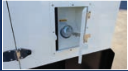
LOCKABLE EXTERNAL FUEL FILL