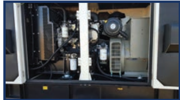
EASY ACCESS FOR MAINTENANCE